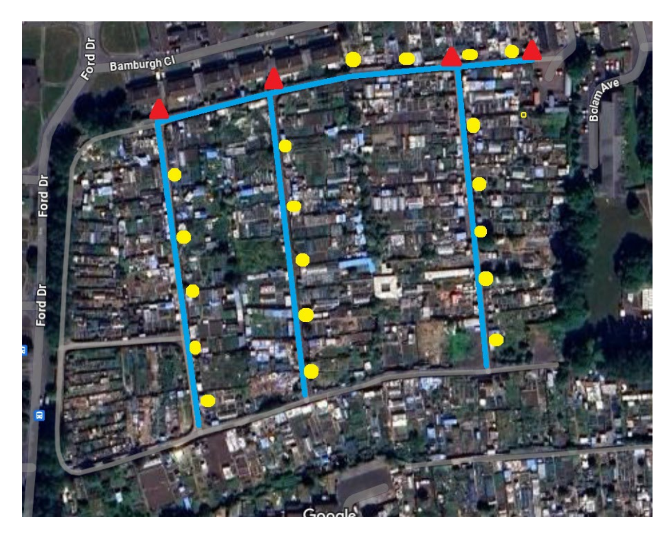
The blue lines indicate the pipework (645 metres) The red triangles indicate stop cocks (4) The yellow circles indicate taps (19)